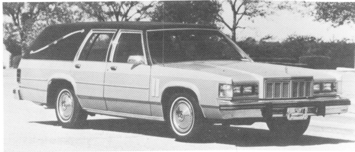
1982 Mercury Regency Traditional Landau Hearse — Available in your fleet color.

The Regency Landau Hearse Conversion: Available in Full Traditional Landau Hearse and also in Type II featuring Removable Landau panels whereas unit can be reverted to passenger car use by detaching professional car components.