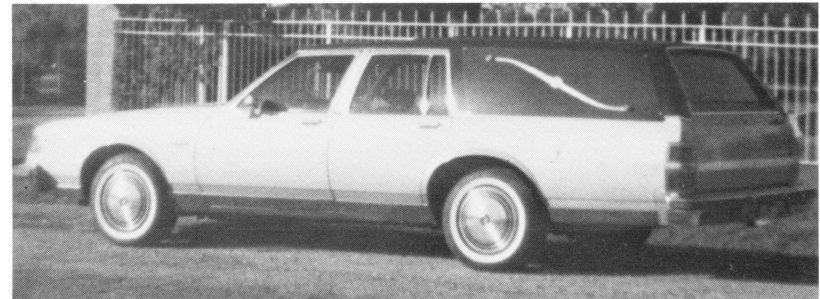
1982 Buick Landau Hearse Type II Conversion. Removable Landau Panels, removable table & removable snap-on color-keyed carpet.